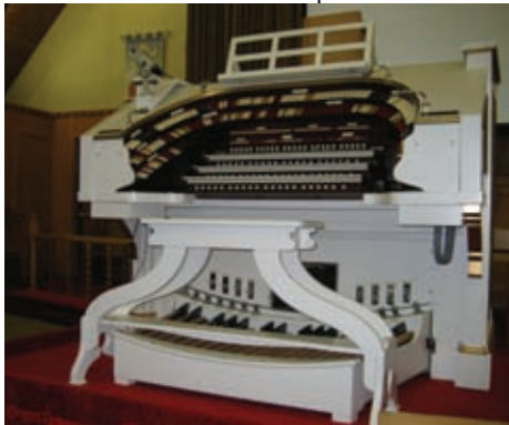
27-rank Kimball Theatre Organ courtesy of Kingston Theatre Organ Society

I would speak of that small group of men, church and radio organists, band director, theatre organist, and teacher who, some thirty years ago formed the Kingston Theatre Organ Society. In the interest of perpetuating a particular art form as represented in part by the “King of instruments” they personally purchased in Ohio, moved, reinstalled such an instrument and have maintained it for the pleasure of all